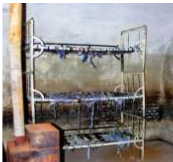
Prison cell with bunk-beds with no mattress, prisoners were obliged to sleep on. Stove for show only, never heated in cold winters.