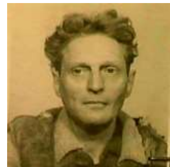
Mug shot of Late Reverend Richard Wurmbrand when held in the Jilava prison.